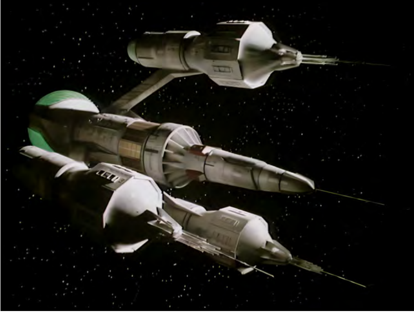
Figure II.1: The spaceship Liberator in "Seek-Locate-Destroy" (S1E6)

ber. At the end of the first series, they capture a supercomputer named Orac. Gan is killed during the second series, after which Blake and Jenna disappear and are replaced by new characters Dayna and Tarrant. At the start of the fourth series, Cally dies and is replaced by Soolin. After the destruction of Liberator, the computer Zen is replaced by a new computer, Slave, on board their new commandeered ship Scorpio.