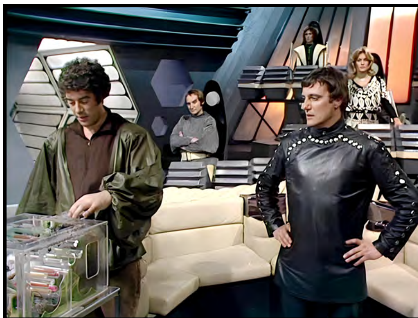
Figure II.7: The crew of the Liberator in "Redemption" (S2E1)

with their weapons pointed at him. Avon steps over Blake's body, raises his gun and smiles. Shots are heard over the end credits. 59