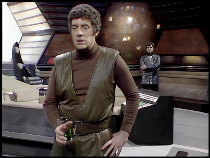
Figure IV.4: Blake & Avon in "Trial" (S2E6)