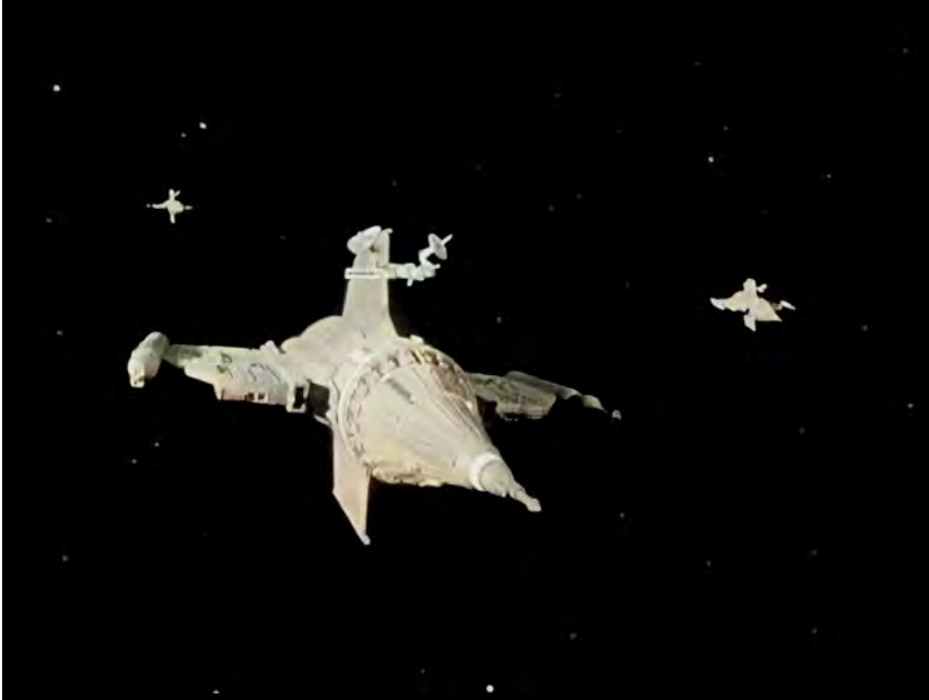
Figure III.1: Federation ships in "Duel" (S1E8)

Tom Baker, and the two wanted to be 'briefly crossing paths' with one another before going their separate ways. Ultimately, the idea was scrapped. 7