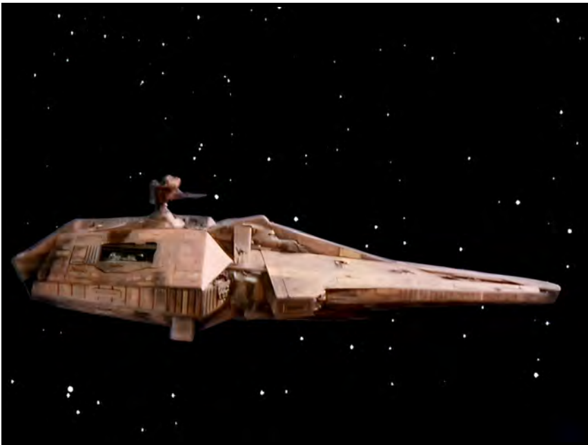
Figure IV.3: The starship Scorpio in "Assassin" (S4E7)

Zeta-3 Particles: Federation communications are converted into zeta-3 particles, which are subsequently scrambled to form an unbreakable code without the need for a cipher machine—a crucial tool in the Federation's quest for control and secrecy in a galaxy rife with resistance and rebellion.