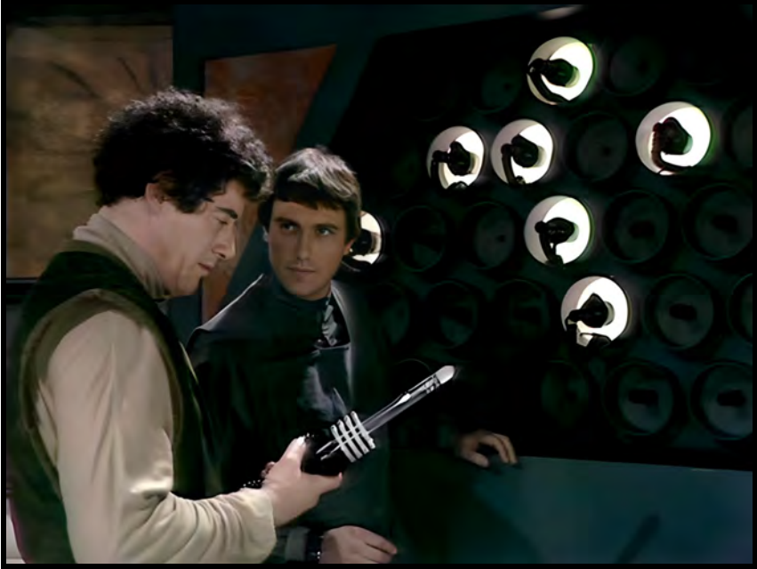
Figure V.1: Blake & Avon on the Liberator flight deck in "Cygnus Alpha" (S1E3)

starship captain and uses the ship with its teleport bracelets and high-tech handguns as tools against the Federation.