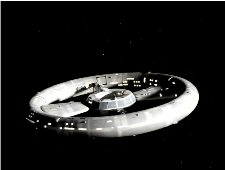
Figure II.5: Space Command headquarters in "Deliverance" (S1E12)