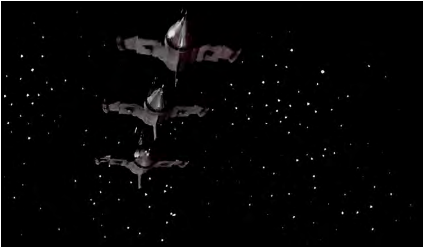
Figure II.2: Pursuit ships in "Hostage" (S2E8)

Roj Blake , played by Gareth Thomas (leader of the crew in series 1–2, guest appearances in series 3–4). Blake is a long-term political dissident who uses the Liberator to wage war on the Federation. He is passionately opposed to the Federation's injustice and corruption and is prepared to accept loss of life in pursuit of its destruction. He thinks nothing of placing himself in danger to protect his crew or advance his cause. Although Blake is respected by many of his crew members, Avon accuses him of fanaticism and recklessness. 8