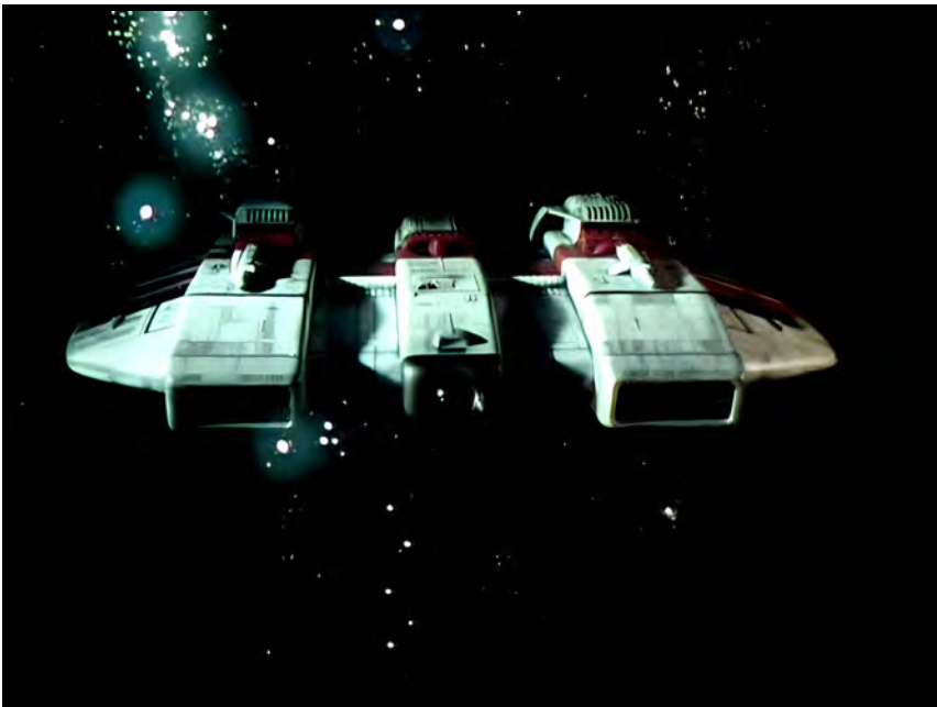
Figure IV.2: Servalan's L-type cruiser in "Assassin" (S4E7)

Computers: Ubiquitous calculating and thinking machines populate this universe. While some respond to speech and communicate vocally, true artificial intelligence remains a rare and elusive achievement.