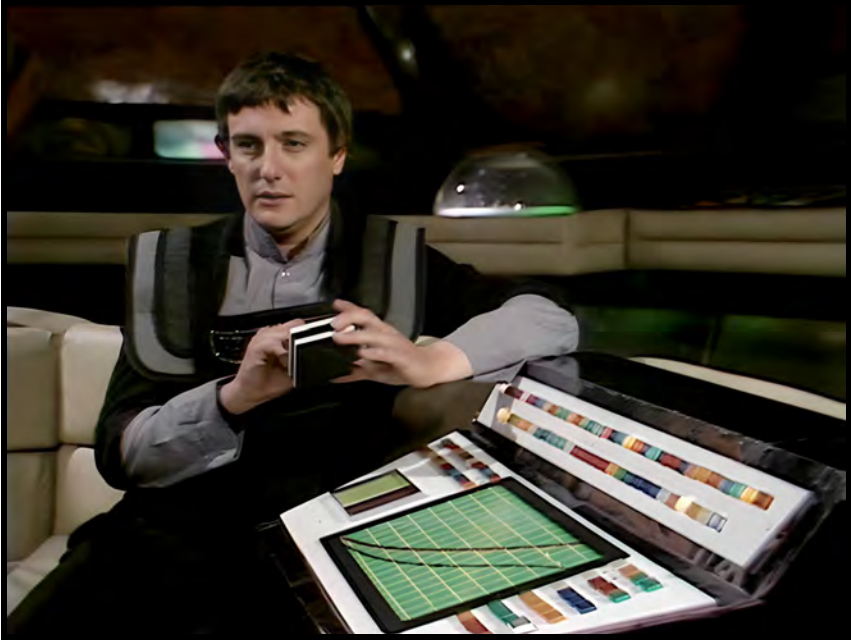
Figure II.4: Avon in "Duel" (S1E8)