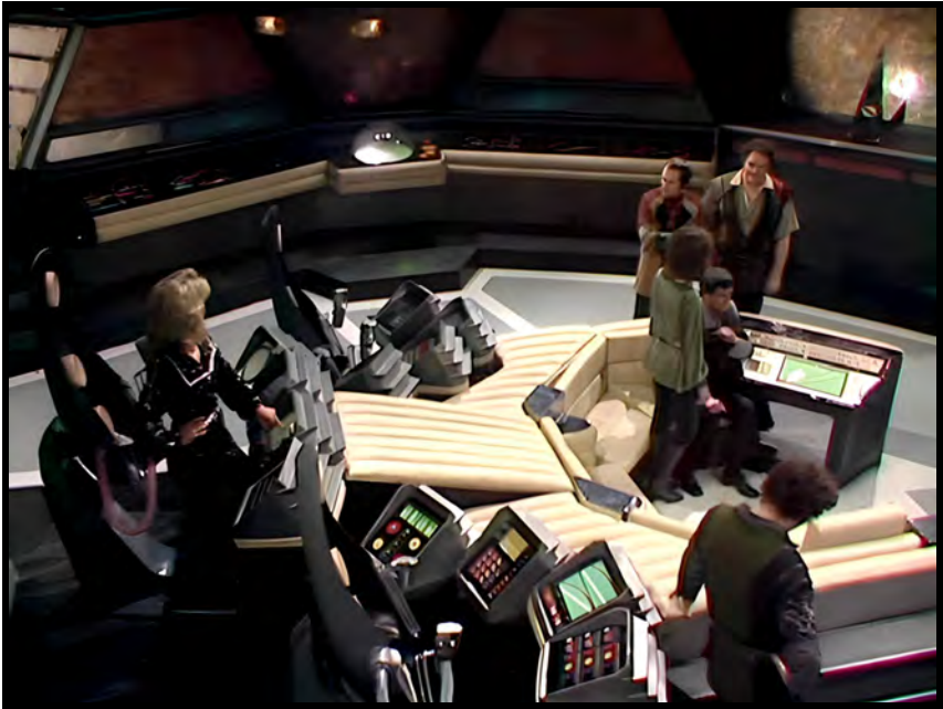
Figure II.3: The bridge of the Liberator in "Deliverance" (S1E12)