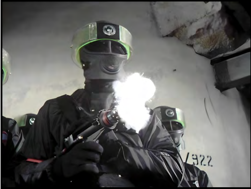
Figure II.6: Federation troopers in "The Way Back" (S1E1)