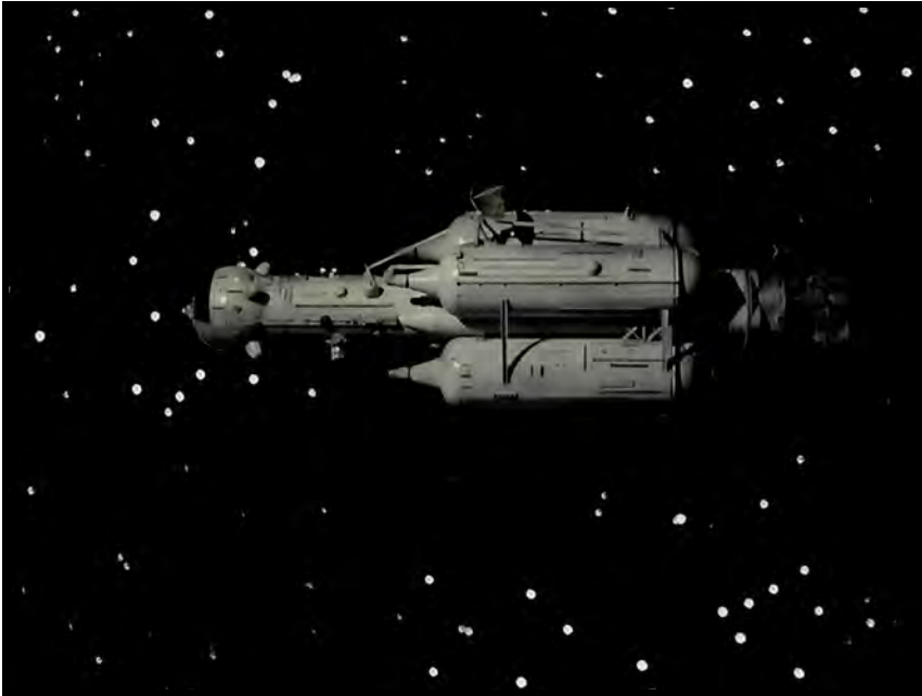
Figure V.2: Derelict ship in "Killer" (S2E7)